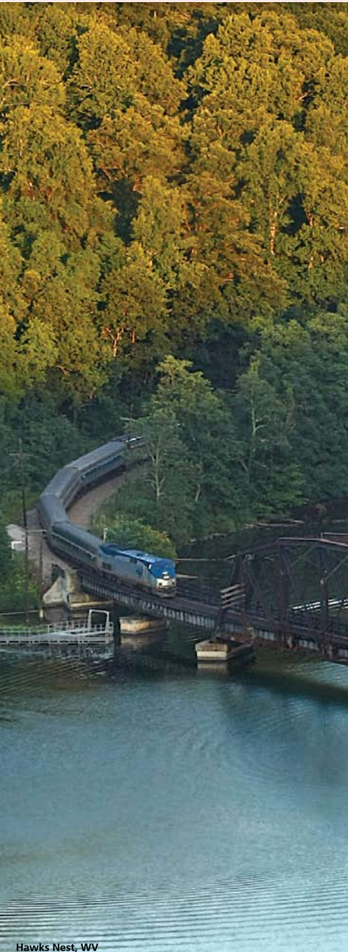
Hawks Nest, WV

Welcome aboard the Cardinal . From the flash of Broadway, the monuments of the nation's capital to the City of Big Shoulders, the Cardinal takes you through historic towns, scenic landscapes and unparalleled natural wonders on its fabulous journey south and west through America's mid-Atlantic, southeast and heartland.